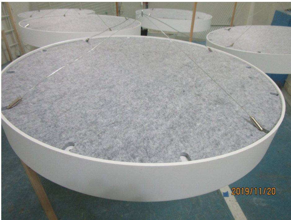
Figure 2 – Detail of individual fixture